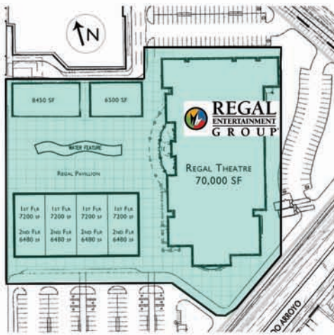
WINROCK TOWN CENTER ALBUQUERQUE, NEW MEXICO / MASTER SITE PLAN PHASE I